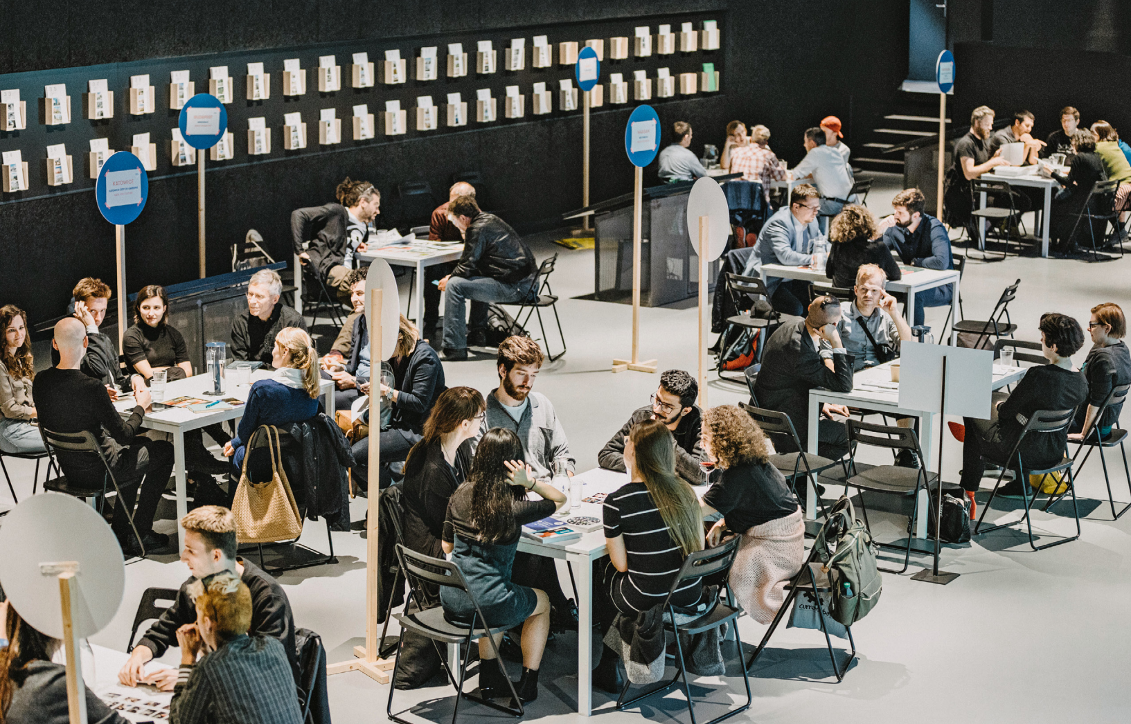
► Shared Cities: The Finale at CAMP in Prague, October 2019

not least, addressing the benefits and dangers of sharing in an economic setting. Discussing the contested aspects of sharing was an integral part of the project.