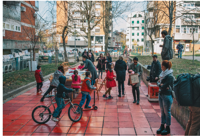
► "Urban Hub 1" collaboration of the Association of Belgrade Architects with Čuvani Parka in Belgrade, November 2017

(Berlin). These simple and inexpensive ideas create much-needed common spaces which help social integration as they reflect simple human needs and competences.